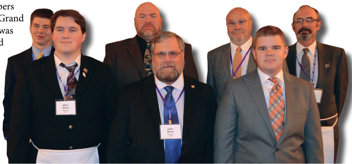
Pictured Above Back Row L to R: